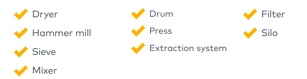
DIAGRAM OF PROTECTION CONCEPT

Fire or explosions in food productions can damage or even destroy the facilities. A GreCon spark detection and extinguishment system monitors and protects the following areas at risk: